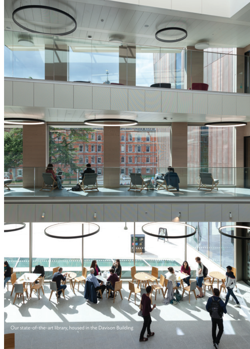
Our state-of-the-art library, housed in the Davison Building

Our Industrial Advisory Board provides feedback on our degree courses and ensures that they remain industry relevant. Our software development company, Code Groovers, gives you the opportunity to work in real-world projects and acquire important transferable skills. We offer integrated Year in Industry degree options where you can apply your learning and gain experience and skills that will help develop your career.