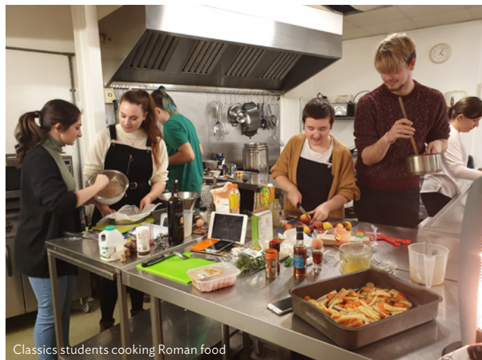
Classics students cooking Roman food

Royal Holloway is part of the University of London, which is home to a world-class community of teaching and researching classical academics. As a student at Royal Holloway, you will have access to exceptional resources, as Senate House, in central London, houses not only the Institute of Classical Studies library, but also the University of London library, to which you will have access along with other college libraries in London.