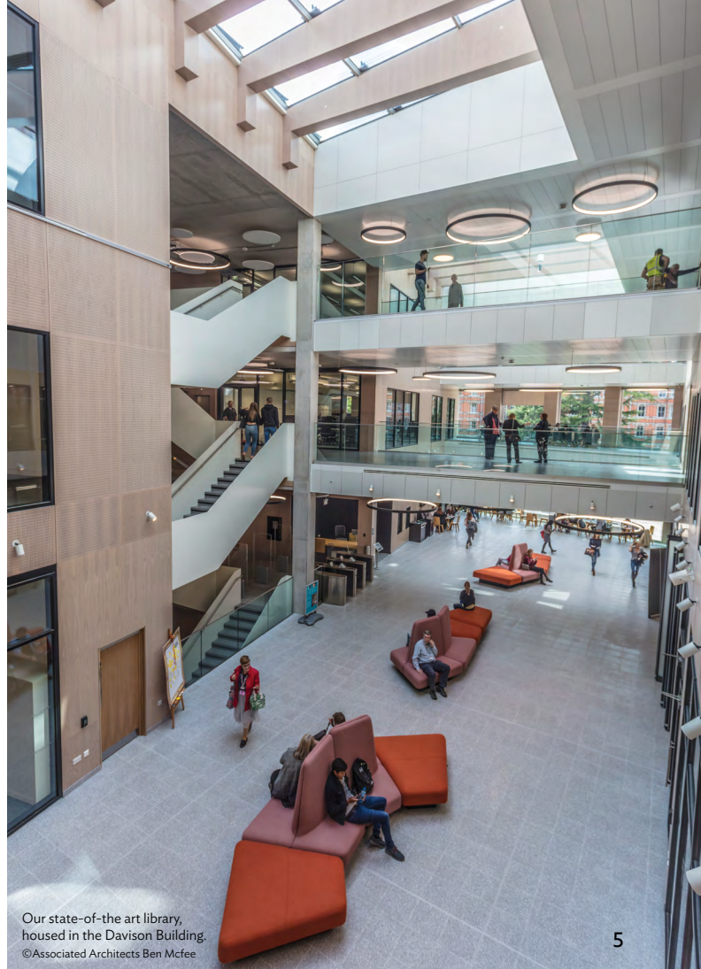
Our state-of-the-art library, housed in the Davison Building.