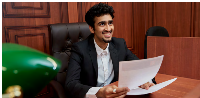
Student in our mock court room

Directly across from the Founder's Building is the Emily Wilding Davison Building, completed in 2017 and home to our state-of-the-art library. It is situated a few seconds walk away from the Arts Building, home of the Department of Law & Criminology.