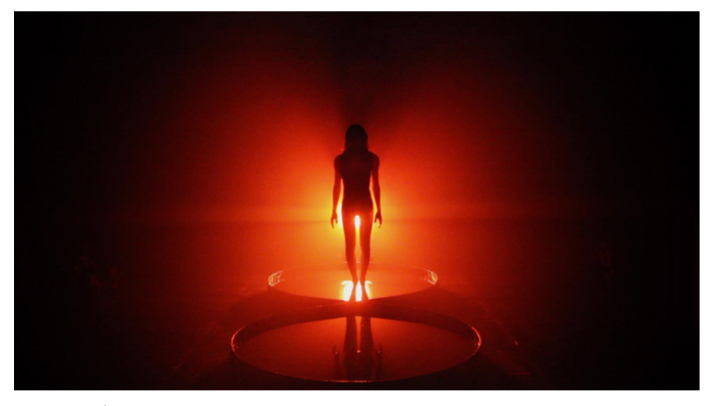
Fig. 6 | Aura (2021) 7 ≈ 8. © Konstantina Tsagianni

The body that rotates on its own axis is the translation that generates light and shadow. The bodysphere constituted by the seven almost eight auric layers, provides the ideal environment to be inhabited by the artist and the audience.