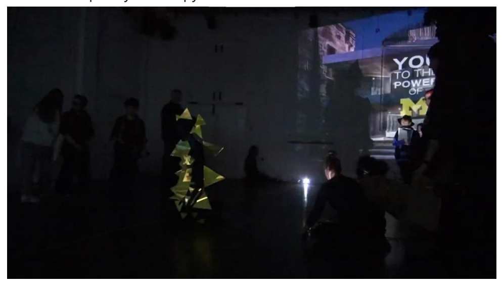
Fig. 2 | Aura (2019) Lar Dom Home. © By the artist

As nora chipaumire uttered, not in these exact words, during a workshop I participated in Warsaw. 'Remember: the size between your legs represents the space you occupy on Earth.'