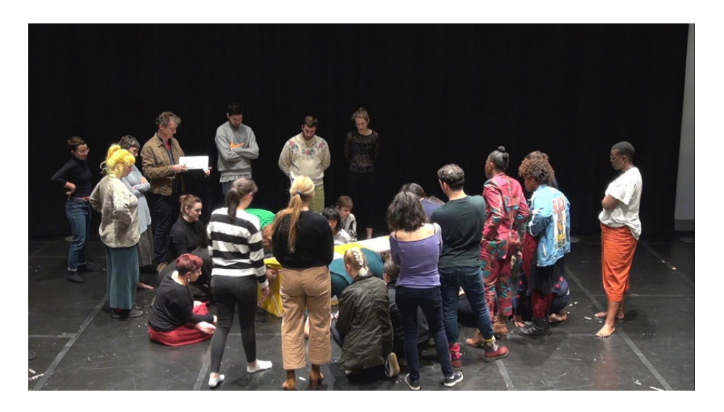
Fig. 1 | Aura (2018) BOX SOLO. © By the artist

It was very important to me to find the 'I': I feel this, this panned to me, I did this. (Jarman 30-31)