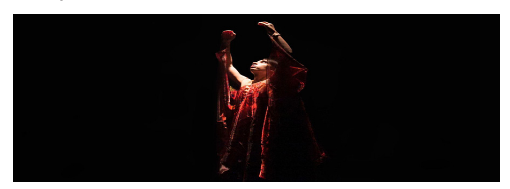
Fig. 7 | Aura (2021) 7 ≈ 8.

To the resemblance of identity — unite and manifold — my artistic practice research is built through different assimilations at a personal and intellectual, academic and social, geographical and epistemological level. If one intends to define it, it works the negative positively, finds calm in calamity, balancing itself between the liminal space, and becoming aware of the causal action. Finally, in the individual it finds the plurality of other voices. A transgenesis.