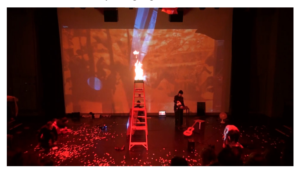
Fig. 3 | Inter-non-disciplinary group (2019) OUTRAGEOUS UNIFICATION, COURAGEOUS INTERFERENCE; PRODUCT, MECHANISED, LAYERED. © By the artists

Additionally, I started building upon a lexicon, which not only contained words but also stored memory: attention, beginning, composition, doorkeeper, exercise, frustration, grammar, half, image, justice, Kafka, law, meaning, newspapers, orange, progress, queer, response, space, time, uninvented, veto, war, xaman, yves, zig-zag.