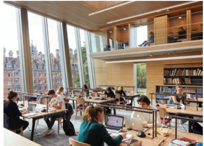
Hurton + Crow/Colominum